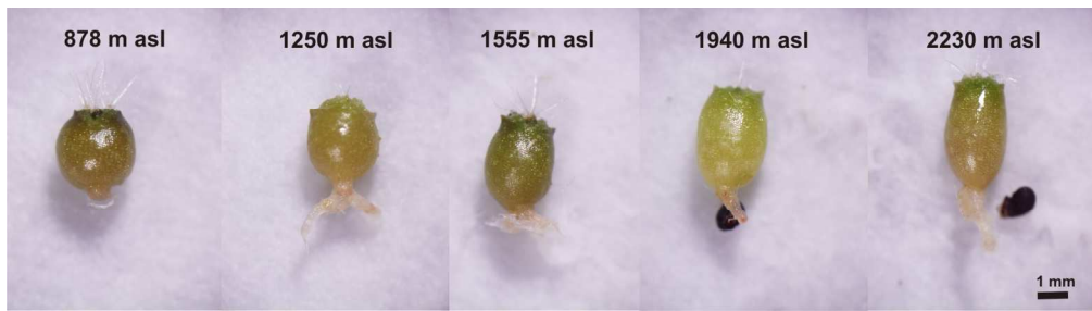
Fig. 3. Photographs of typical seedlings of Gymnocalycium monvillei for each altitudinal class. (THESE PHOTOGRAPHS CAN BE PRESENTED BLACK & WHITE) 152x42mm (300 x 300 DPI)

For personal use only. This Just-IN manuscript is the accepted manuscript prior to copy editing and page composition. It may differ from the final official version of record.