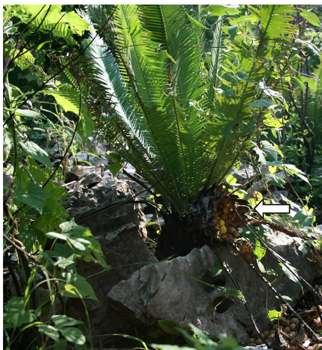
Figure 1. Dioon edule adult female plant with disintegrated cone in the base (arrow), and the seeds dispersed in the immediate vicinity of the maternal plant.

Below the canopy in tropical forests the amount and quality of the light transmitted is reduced, affecting seed