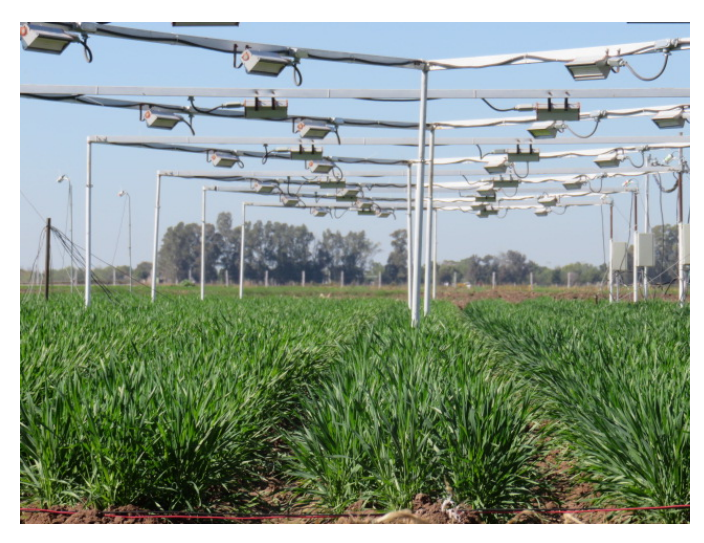
Figure 1. Aerial image of the experimental warming assay during the crop cycles 2016–2017 and 2017–2018.